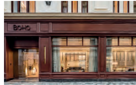
Hotel BoHo, Prague