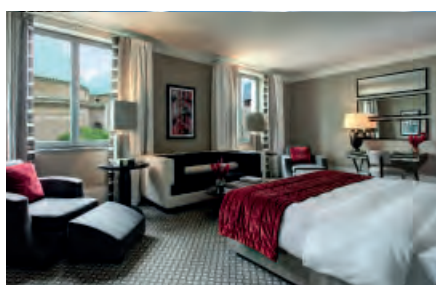
Junior suite, Hotel de Rome, Berlin