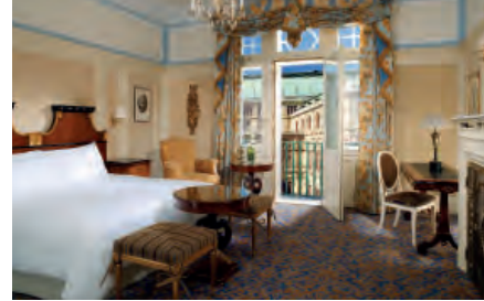
Deluxe room, Hotel Bristol, Vienna