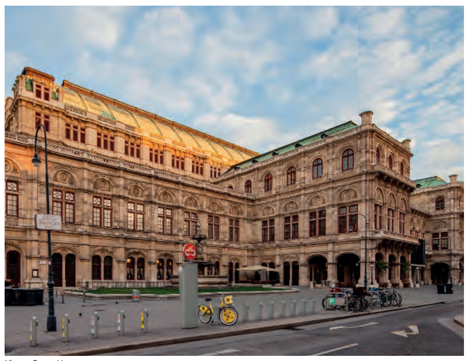
Vienna Opera House