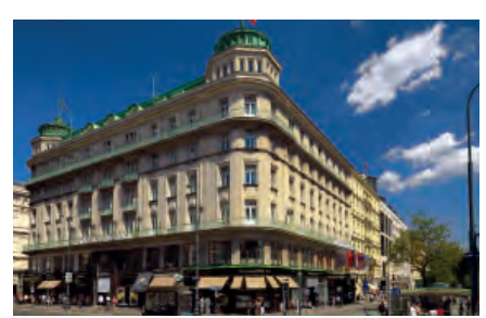
Hotel Bristol, Vienna