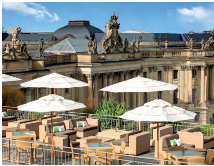
Hotel de Rome, Berlin, rooftop terrace

Hotel Kaiserhof Vienna is situated a few steps away from Naschmarkt and the State Opera House. The hotel is family-owned and enjoys 74 comfortable rooms and suites.