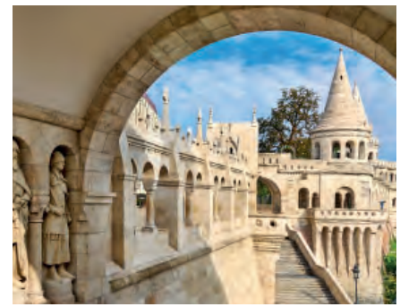
Highlights of Berlin, Prague and Vienna rail tour