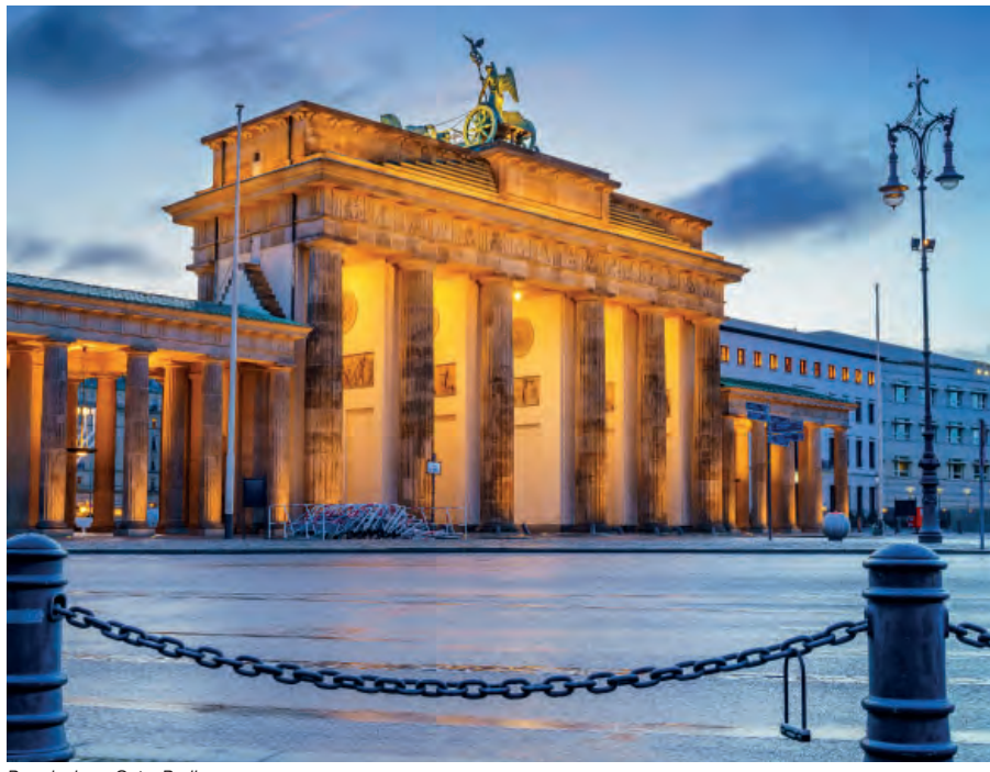
Brandenburg Gate, Berlin

This rail touring holiday offers highlights of three historical central and Eastern European cities in seven nights: Berlin, Prague and Vienna. Begin your rail holiday in Germany, exploring its capital, Berlin, before travelling south to Prague and the ancient capital of Bohemia. Your third destination is the capital of Austria and once focal city of the Austro-Hungarian Empire.