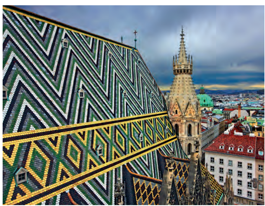
/ienna, St Stephan's Cathedra

At the end of the tour you can fly back to the UK or you can leave Vienna in the evening on the overnight sleeper train (2 berth cabin included) to Cologne. Arriving in Cologne in the morning, you transfer to the Brussels train and then on to London by Eurostar.