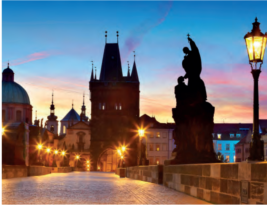
Charles Bridge, Prague

Spend another day exploring Prague's old town where you can enjoy Old Town Square, the Astronomical Clock (dating from 1410 and the oldest astronomical clock in the world that is still working) and Wenceslas Square. Prague enjoys a cultural reputation of immense stature in Europe and there are numerous opera and concert performances that can be booked. Unique to Prague is the Laterna Magika where classical principles of non-verbal theatre mingle with dance, film images and black light theatre.