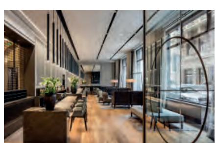
Hotel BoHo, Prague